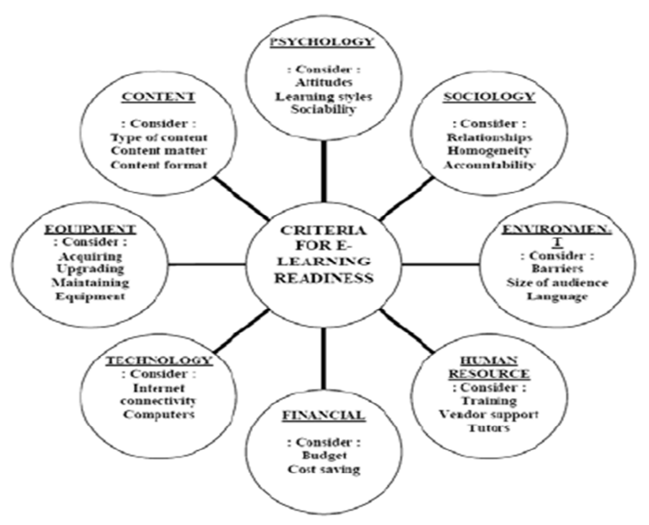
Figure 1. Simple e-learning model (Adapted from Chapnick, 2000)

The model enables educators to assess areas of success in their institutions in e-learning and the areas which need improvement. Apart from Chapnick's model, other similar models are available to access e-learning readiness of institutions (Chapuick, 2000). The current pressure to integrate ICT in classroom instruction requires a well-planned approach of assessing the needs for technology integration. E-learning readiness assessment is an approach to identify their current levels of teachers' skills, and competencies to integrate ICT. In order to do this, a questionnaire was designed and administrated to 44 randomly selected lecturers. The questionnaire was organized around 10 themes